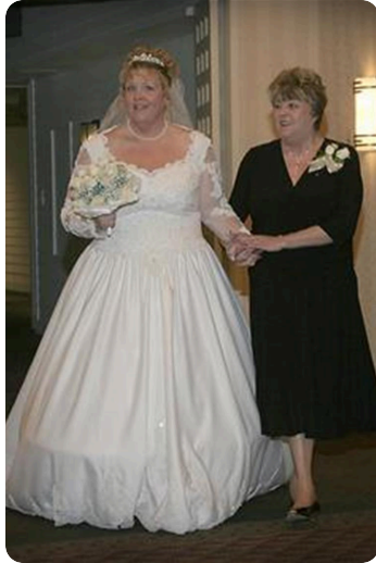
Mom gave me away. 3-25-07